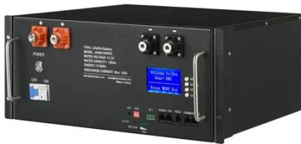
Table 4-17 Battery cabinet technical specifications Favorite Download Document ID:EDOC1100136320 Views:34013 Downloads:2363 Average rating:5.0Points